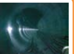
Cairo Subway System Egypt Project value: 850M€