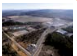
ITER Cadarache, France Project value: 5.2bn€