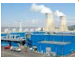
Georges Besse II Tricastin, France Project value: 2bn€