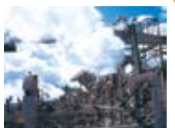
Refinery France Project value: 500M€